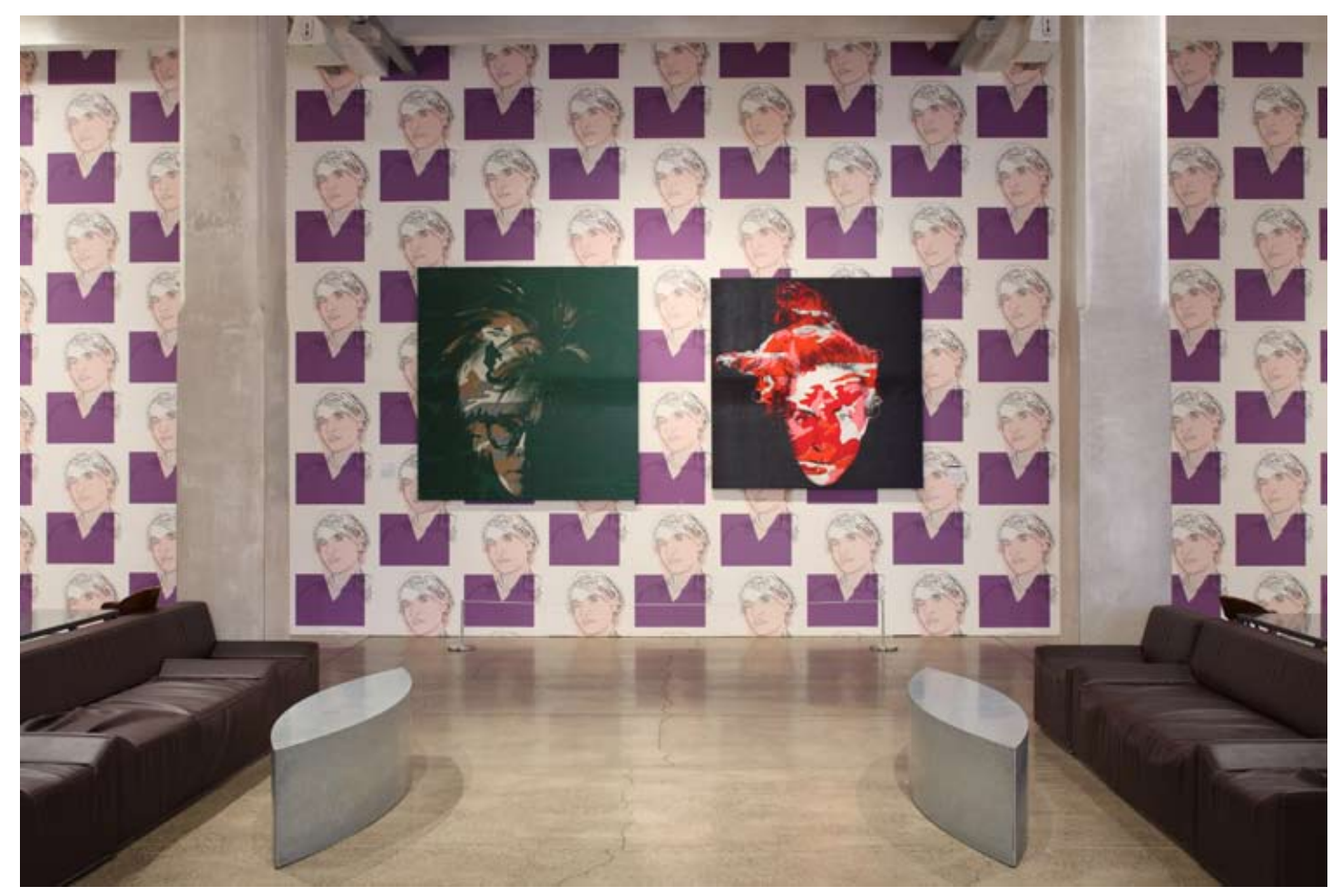
Installation view of the Warhol Museum lobby during Deborah Kass: Before and Happily Ever After

For example, the Warhol Museum's lobby features two nearly identical paintings side-by-side: Warhol's "Camouflage Self Portrait" (1986) and Kass's own "Camouflage Self-Portrait" (1994). While both portraits present a queer artist fashioning themselves against an overtly masculine, military pattern, Kass's self-portrait, with her hair teased up to reflect Warhol's wig, reveals the incredible difference in fame and notoriety between Warhol, a male art icon and Kass, a female artist whose image is certainly not as iconic.