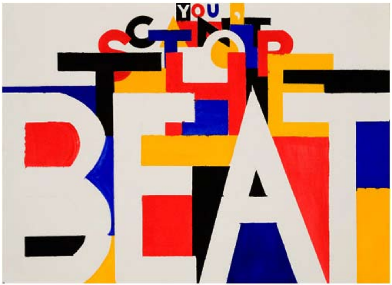
Deborah Kass, "You Can't Stop the Beat" (2003)

The exhibition ranges from Kass's early landscape and art historical paintings from the 1980s and early 1990s, where Kass would mix the styles of modern art masters such as Cezanne, Picasso, and Pollock with cartoons to reveal the male-dominated imagery that pervades modern art and popular culture to her recent language-based series, feel good paintings for feel bad times.